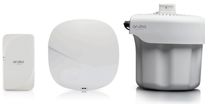
Aruba Access Points 205H, 325 and 275